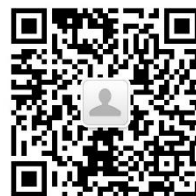
(QR CODE 2)