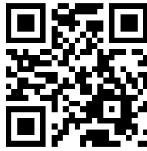
(QR CODE 3)

*Remarks: If the activity is held on 1 Sept. and ended on 9 Sept., the data will be uploaded within 10 days after 9 Sept.